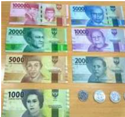
This is the Indonesian currency rupiah denomination