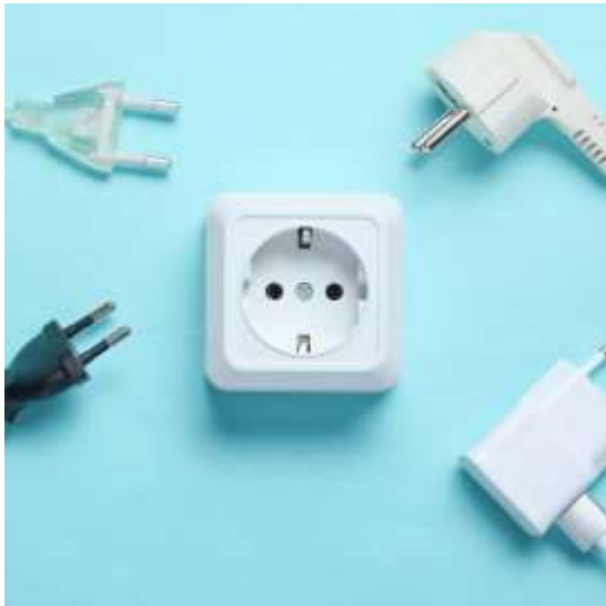
This is the power plug used in Indonesia